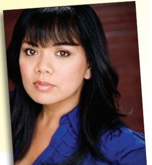
Actress plays Imelda's yaya in musical B8

Award-winning documentary to screen in San Diego fest B6